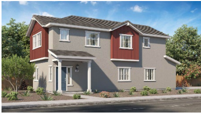
A - Farmhouse

5744 MOLINO CIRCLE, ROSEVILLE, CA 95648 | DRHORTON.COM/SACRAMENTO