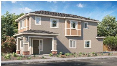
C - Prairie