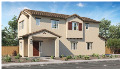
D - Mission