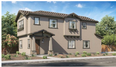
B - Craftsman